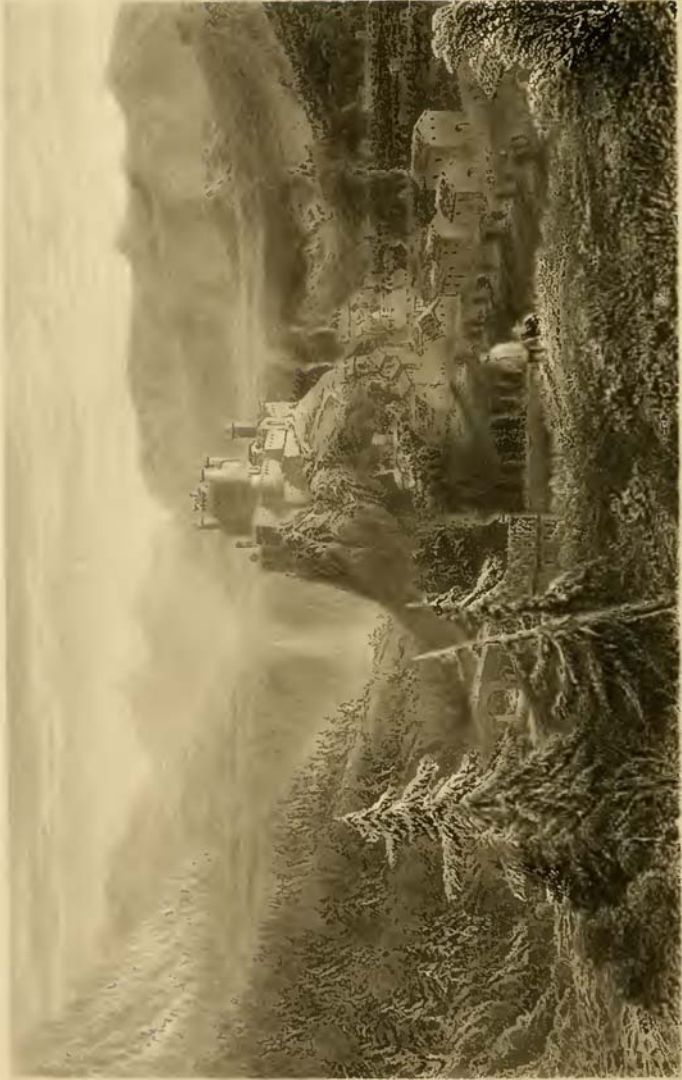
View of the Mountains of the Alps