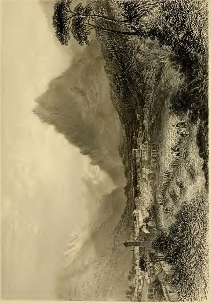
View of the Mountains of the Province of Mexico